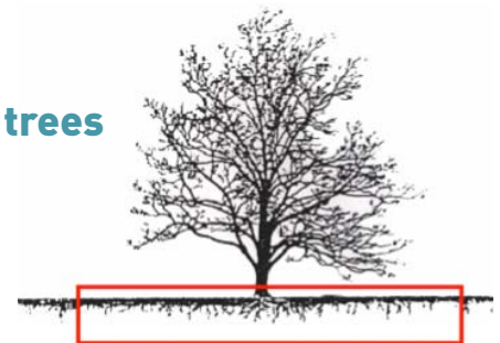
Red indicates area under the canopy to water.

Trees are one of the most valuable assets in a landscape. A tree's roots grow horizontally and can spread 2-4 times wider than the height of the tree, and wider than the tree's canopy. Water should be applied within the entire canopy of the tree. Water deeply and slowly to many locations under the canopy. To assure the survival of a tree, apply 10 gallons of water for each inch of the tree's diameter per watering. Apply mulch within the canopy at a depth of 3-4 inches, leaving 6 inches between the mulch and trunk.